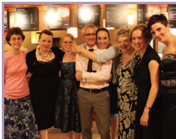
The members of the Advanced Conductors course on last year's Summer School.