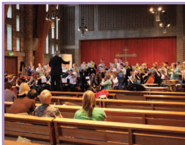
One of the concerts at last year's SfP Summer School.