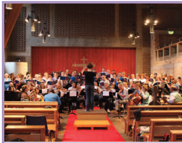
Final rehearsals for one of the 2010 Summer School concerts.

Apply using the online application form via the events page www.singforpleasure.org.uk or send in a paper application form.